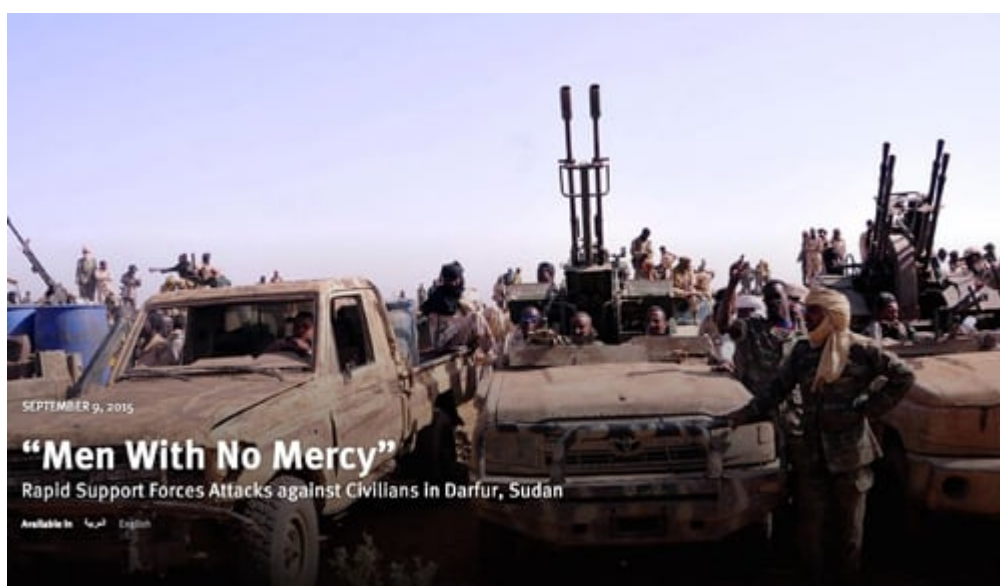
Janjaweed with Armed Technicals, Human Rights Watch