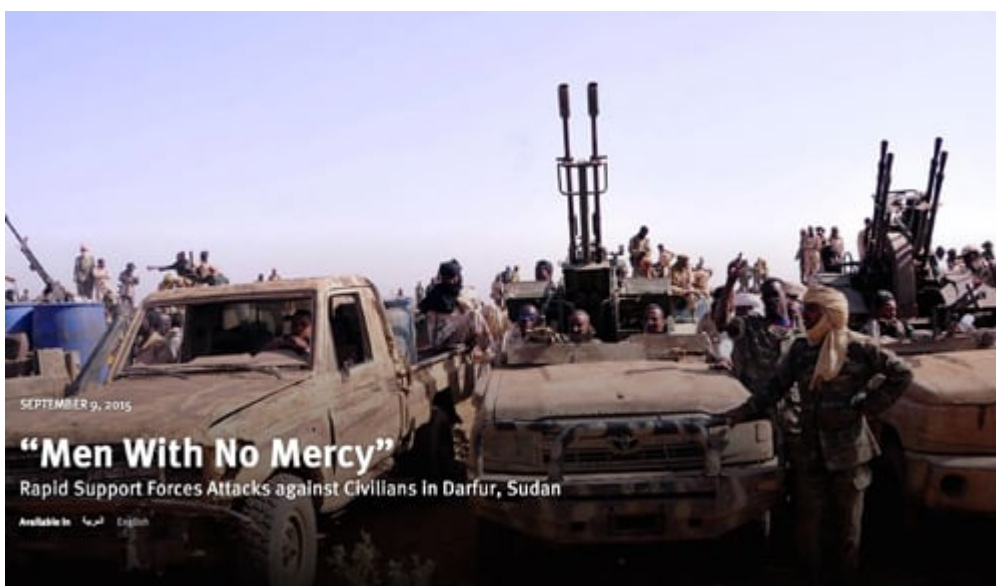
Janjaweed with Armed Technicals, Human Rights Watch