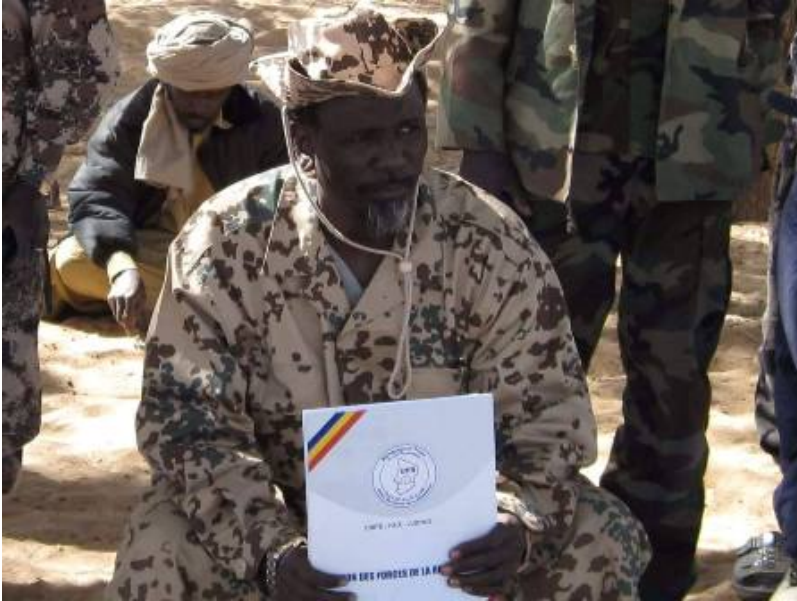
Chadian Insurgent Leader Timane Erdimi of Union of Forces of the Republic

Darfurians have no venue to bring complaints about their grievances or obtain justice in Sudan.