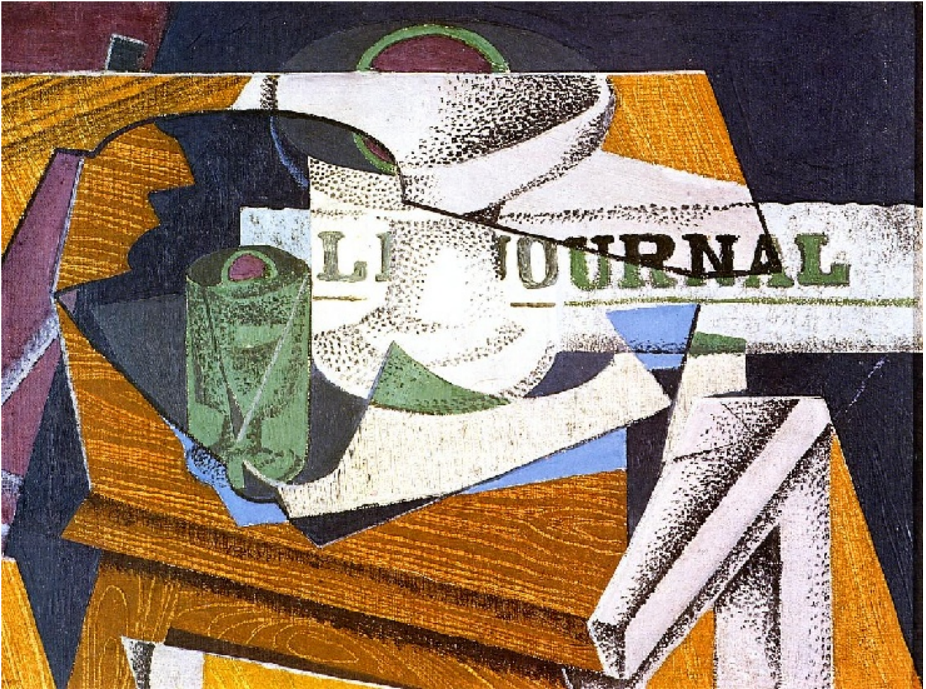
Fruit Bowl, Book, and Newspaper, Juan Gris, 1916