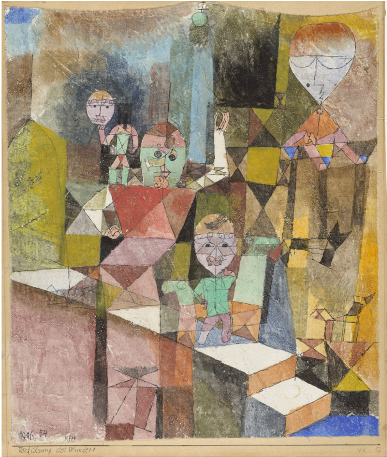
Introducing the Miracle, by Paul Klee, 1916

For your information, most of the writing here was not