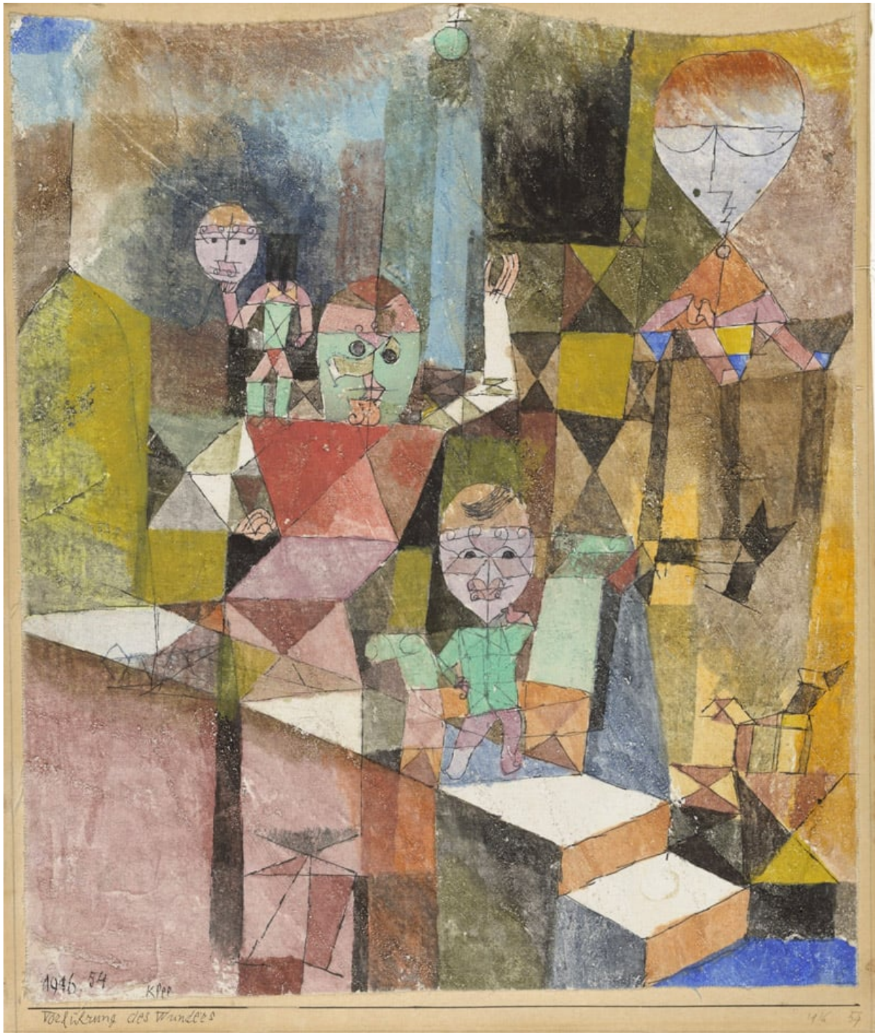
Introducing the Miracle, by Paul Klee, 1916

For your information, most of the writing here was not