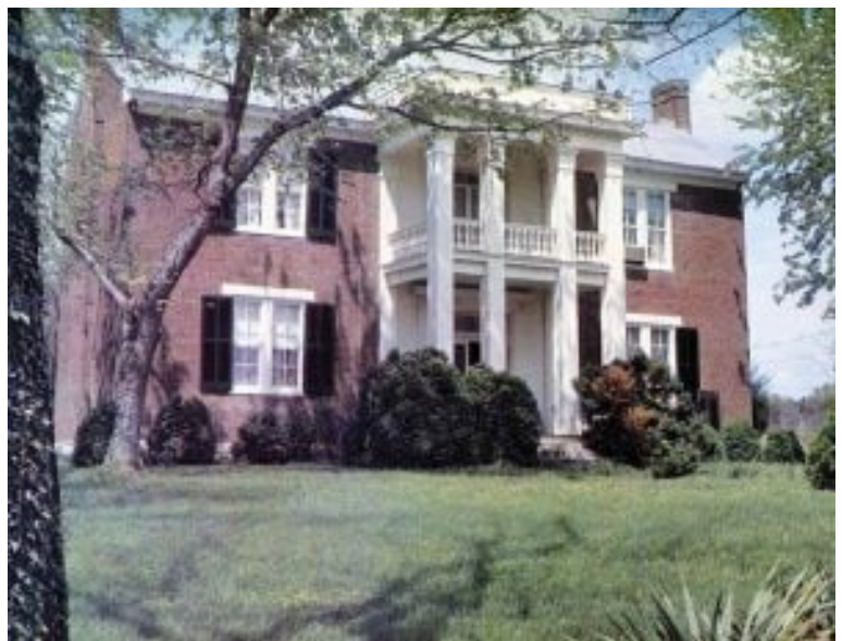
Harrison House, Franklin, Tennessee

My wife did not buy boots and although I love wide brimmed hats I was wearing a Safari hat from East Africa and sported a blue Somali scarf, which drew many compliments from the younger set. I did not feel like a cowboy but I did feel a tad hip. I did not buy anything. And so, with shame on my mind we went off to be honoured.