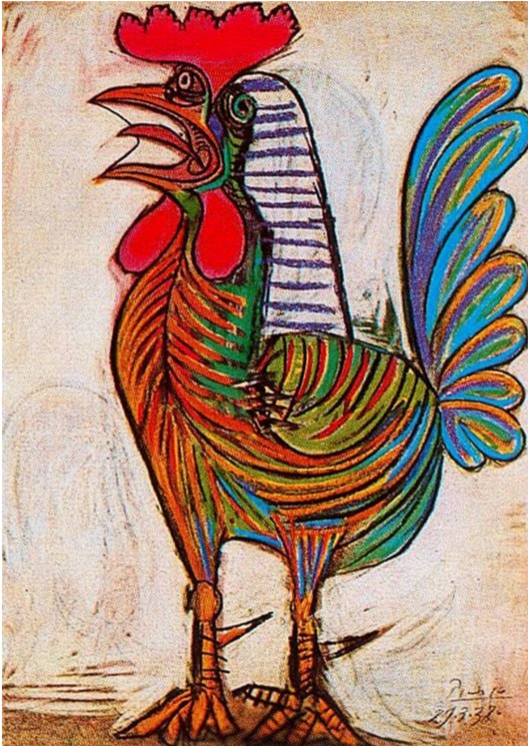
A Rooster, Pablo Picasso (1938)