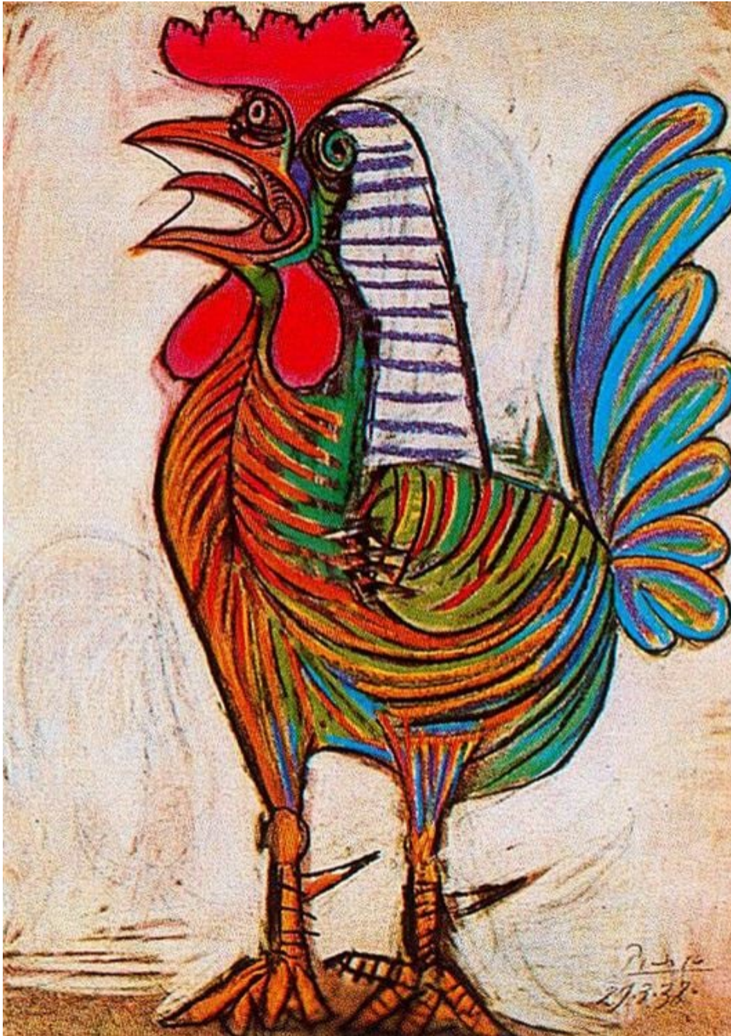
A Rooster, Pablo Picasso (1938)