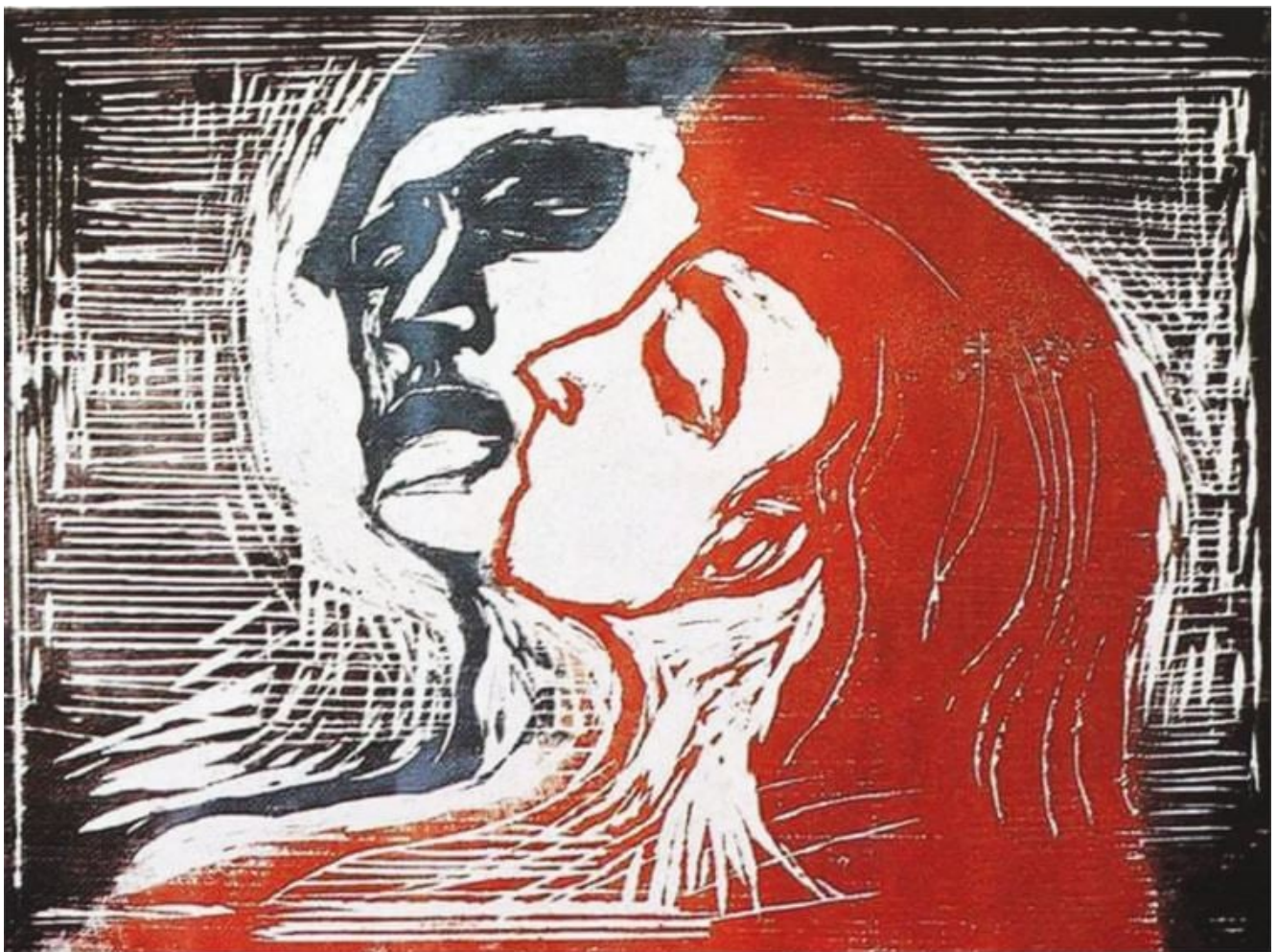
Man and Woman, Edvard Munch, 1905

We live in a very encumbered age. We are encumbered by our wealth, our technology, our leisure, regulations, laws, social