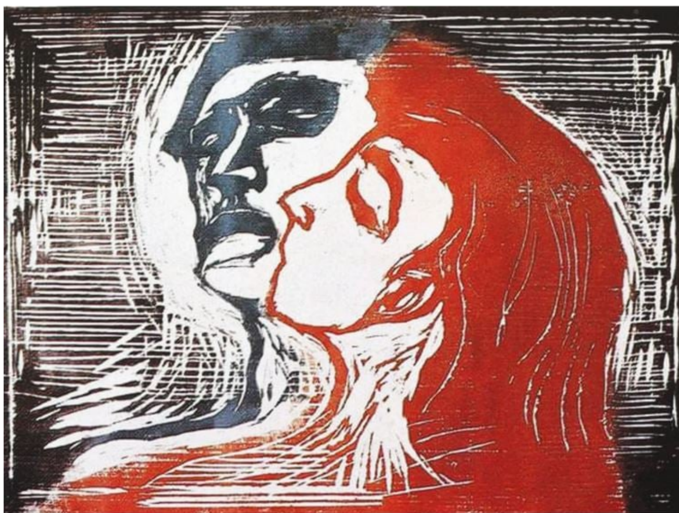
Man and Woman, Edvard Munch, 1905

We live in a very encumbered age. We are encumbered by our wealth, our technology, our leisure, regulations, laws, social