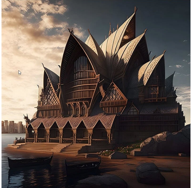
GetAgent combines Sydney Opera House with Russian ecclesiastical architecture

AI is projected to replace mainly white-collar entry and mid-level positions in banking, architecture , engineering, data entry, film, customer service, and most non menial jobs. Para legals will not be needed much except someone to prompt the AI for briefs. If you can replicate anyone's voice then only a sample will be needed for complete scripts for animated films. The conversation is typed on an AI program and that person's voice pronounces all the dialogue thereafter. An ailing world leader which has many sound bites and recorded moving images can be sound printed while in good health and when ill or dying as a doctored AI still or moving image can make any number of animated statements indefinitely.