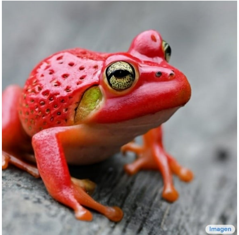
'Strawberry Frog,' by Mohammad Norouzi

Imagine a Google or Bing search engine on steroids. Imagine your worst nightmare vis a vis apocalyptic movies and books showing machines taking over humanity. Well, this development is knocking on our doors right now.