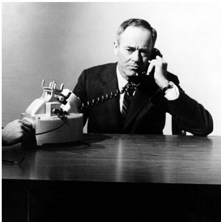
Henry Fonda in 'Fail Safe,' 1964

hilarious take-off, made the point very clear. There is no going back when the cat is out of the bag. The scenario dramatized was in the deployment of nuclear weapons without provocation—an accident. In both films it was not possible to revoke the order and thus worldwide annihilation ensued.