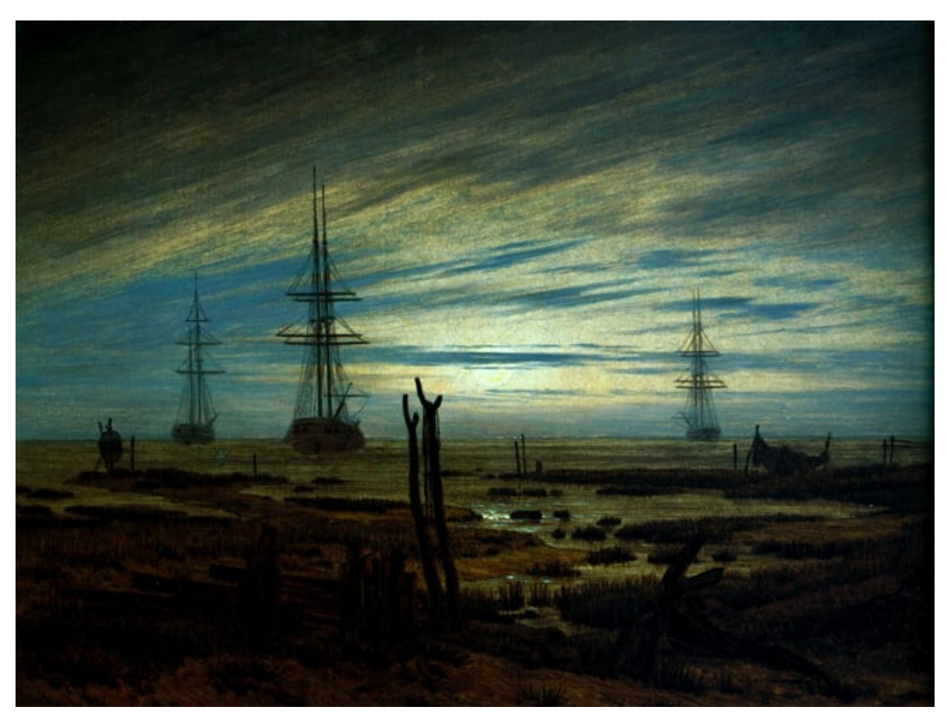
Schiffe auf Reede, Caspar David Friedrich, 1816