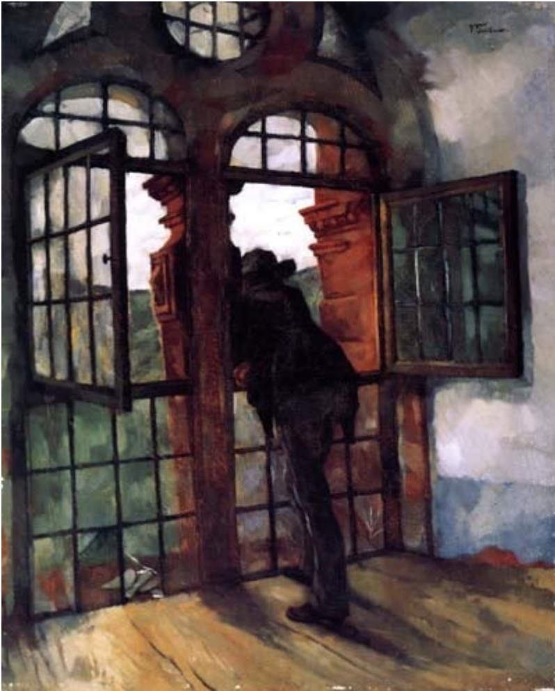
View from Heidelberg Castle, Wilhelm Trübner, 1873