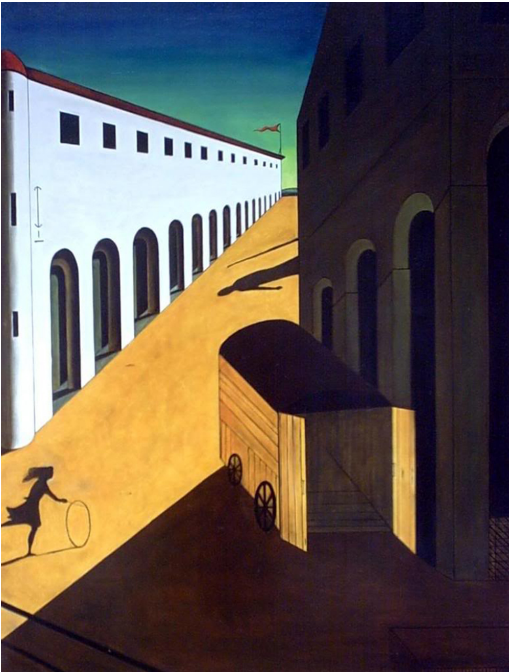
Mystery and Melancholy of a Street , Giorgio de Chirico, 1914