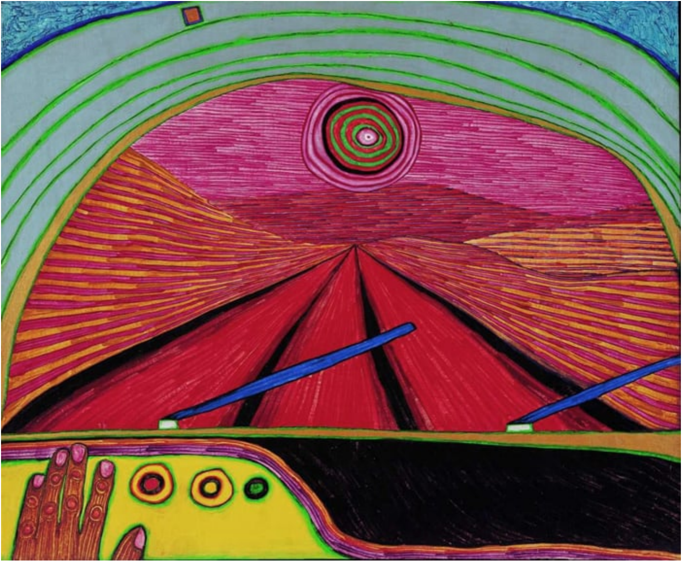
626 The Way to You , Friedensreich Hundertwasser, 1966