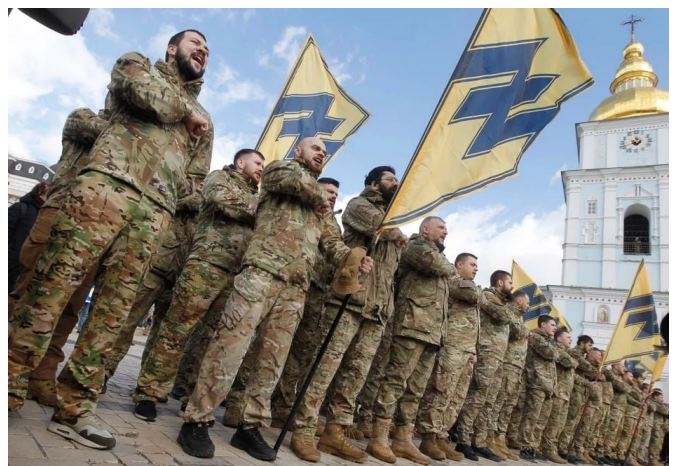
Ukrainian veterans of the Azov Battalion, formed by a white supremacist and banned from receiving U.S. aid, attend a rally in Kyiv.

While Zelensky's image as a democratic leader has been central to his global appeal, his actions suggest otherwise. In November 2023, he announced the suspension of Ukraine's elections, citing the ongoing war. This decision, though framed as a necessary wartime measure, reveals a concerning trend of consolidating power. According to Ukraine's constitution, presidential and parliamentary elections are prohibited during martial law; nonetheless, Zelensky's five-year term expired in March 2024, and he has made it clear that he will not hold elections.