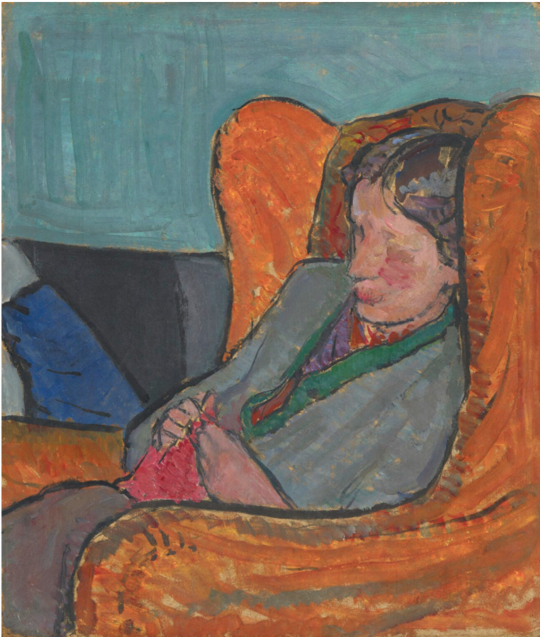
Virginia Woolf, Vanessa Bell

Virginia Woolf's sister Vanessa Bell, nee Stephen, a painter,