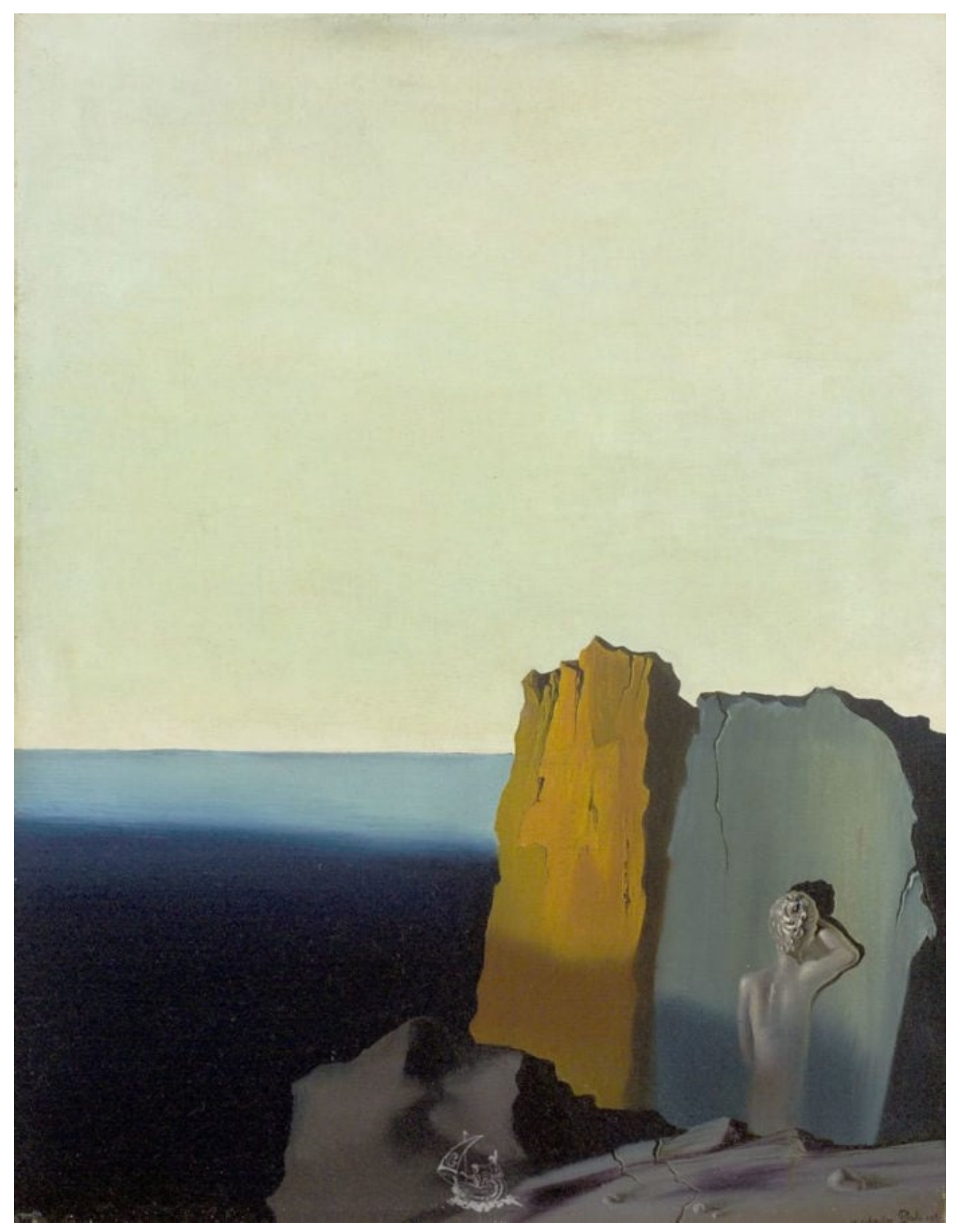
Solitude (Salvador Dalí, 1931)