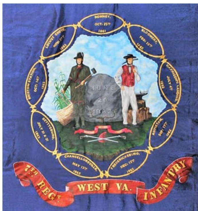
Flag of 7th West Virginia Infantry Regiment of the Union army (Southern white men who fought and died to preserve the Union and abolish slavery)

Almost 120,000 Unionists from the South served in the Union Army during the Civil War and Unionist regiments were raised from every Confederate state except South Carolina. These men were often in complete disagreement with the wealthy eastern planters. There were similar groups elsewhere in the border and upland South for whom "white privilege" was not their shared heritage with the despised wealthy slave owners who had forced civil war upon the country.