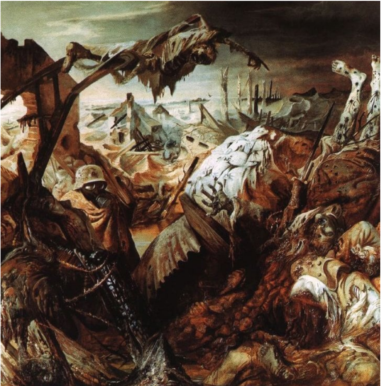
The Trench , Otto Dix, 1923