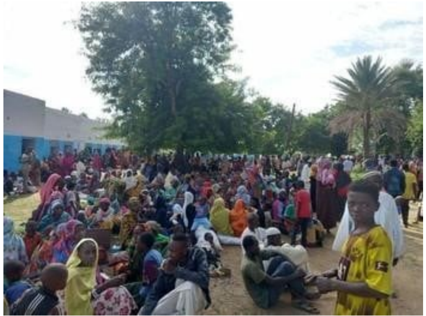
Internally displaced people in Blue Nile State followed the tribal clashes, Radio Dabanga

to exploit the continent's rich resources.