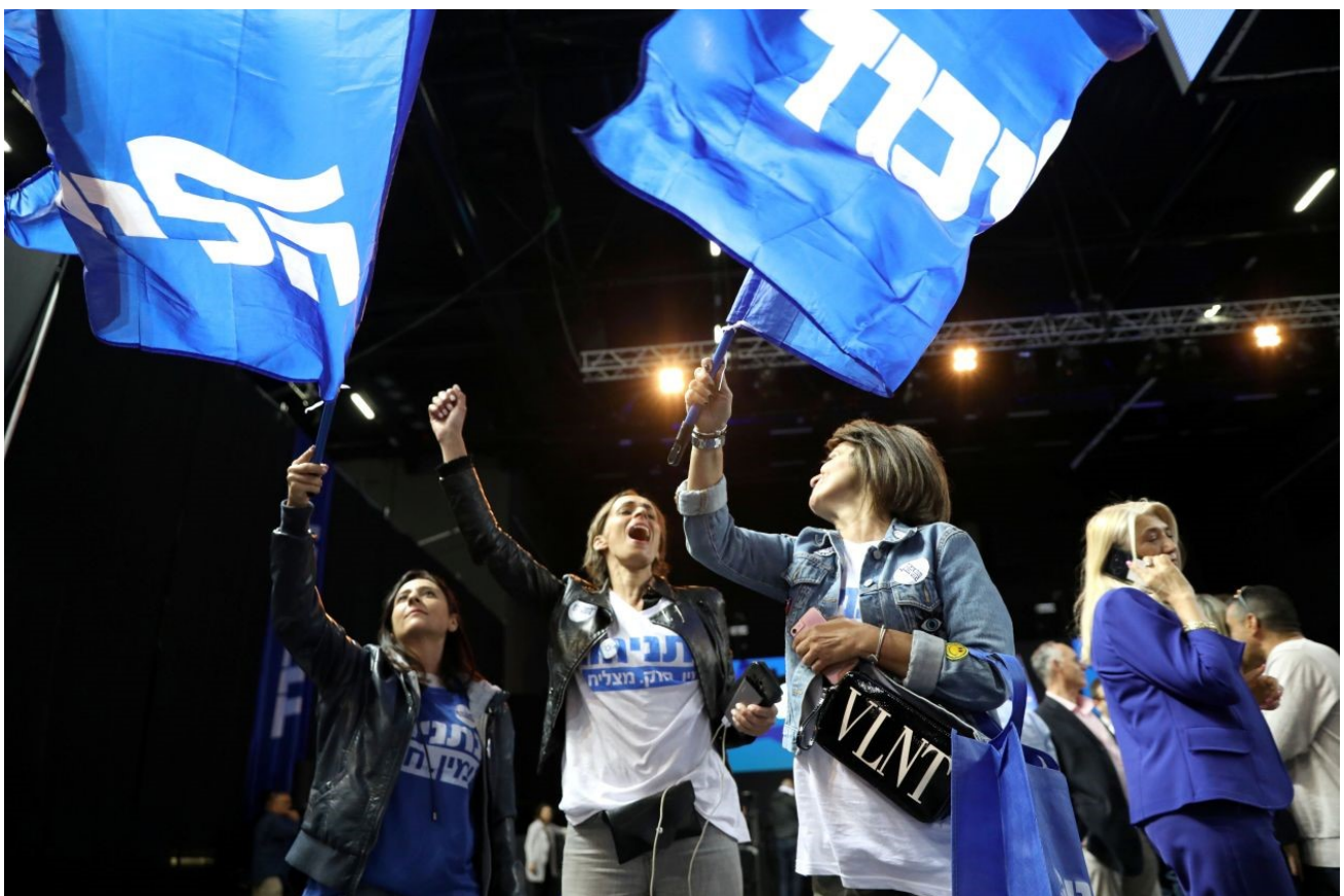
Israeli Supporters of PM Netanyahu at Likud Party Headquarters, Tel Aviv, April 9, 2019