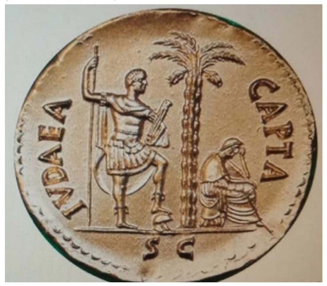
Iudea [Judea] Capta coin

Due to painful Family matters , as fate would have it, I found myself living in Rockville, Maryland to be near my son in 2024.