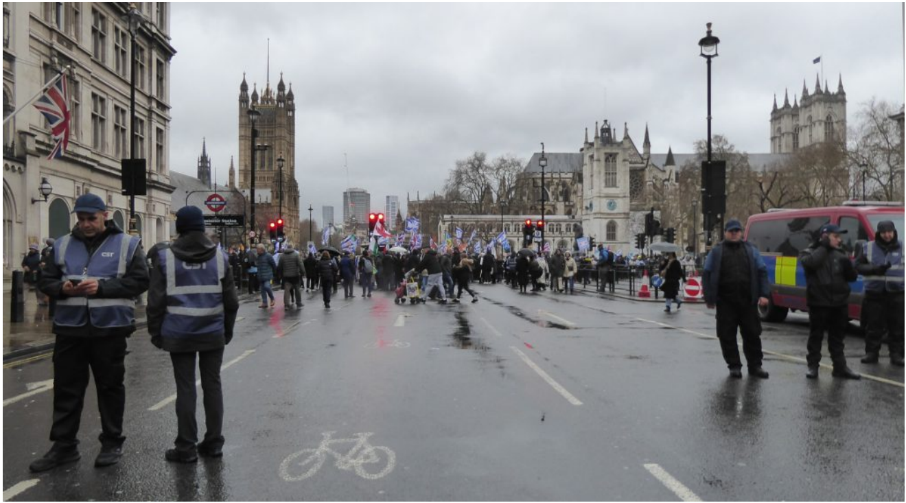
Alert men of Shorim were spotting the approaches to the rally.