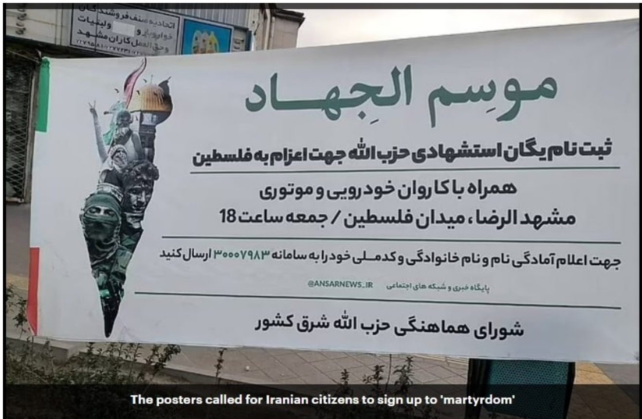
The posters called for Iranian citizens to sign up to 'martyrdom'

These posters declare, 'It's time for Jihad,' and seek individuals to join a 'special battalion of martyr seekers for Palestine.'