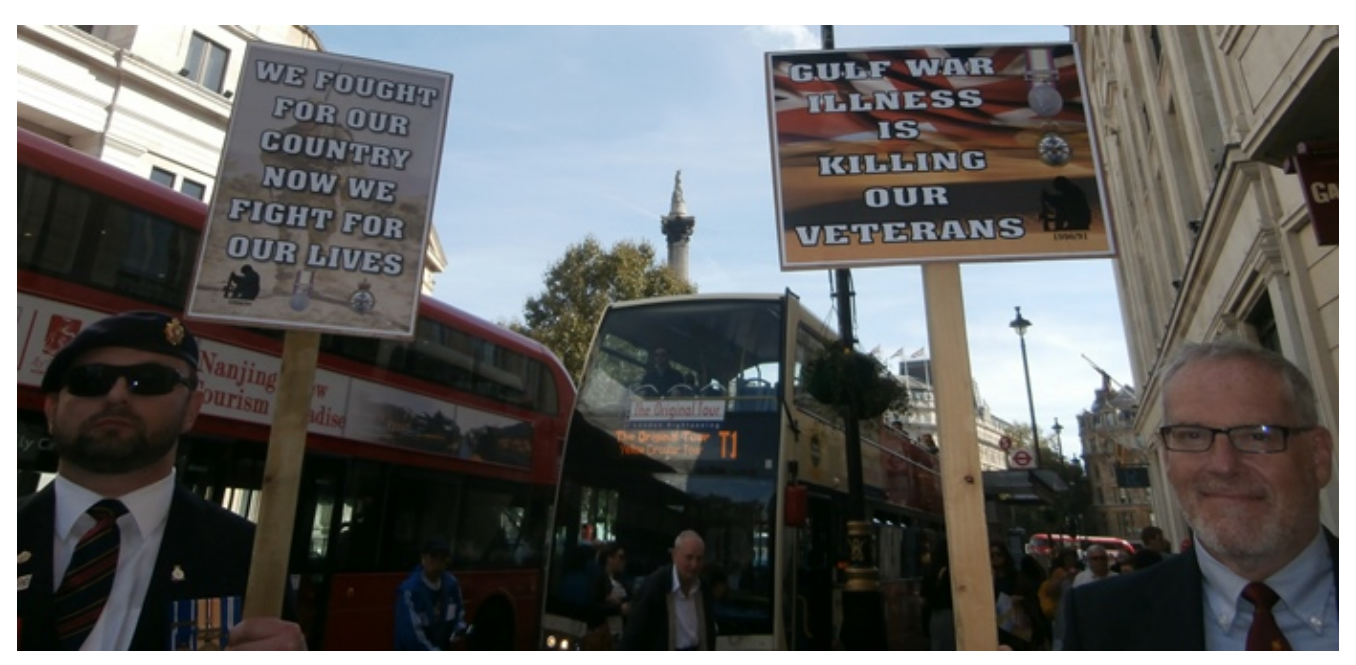
Across Trafalgar Square and the statue of Admiral Lord Nelson looking down.

readers will know Gulf War Syndrome, or Gulf War Illness affected <u>The Last of the Light</u> <u>Brigade</u>