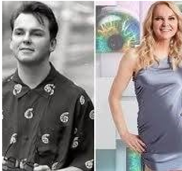
BBC's India before and after

The stakes for all biological women in this most toxic of culture wars was also captured recently by @CarolineJohnson on X (nee twitter). Johnson asked; "Must I give up my rights to free speech, safe spaces, sports, and identity (as a woman) so that you (dysphoric males) are affirmed (as fake females)?"