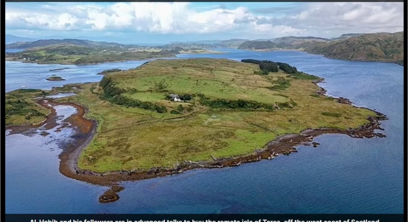
Al-Habib and his followers are in advanced talks to buy the remote isle of Torsa, off the west coast of Scotland

Torsa, which is one of the Slate Islands, is just over a mile long and has one farmhouse. It is accessible only by private boat from Luing — itself reached via a ferry from the island of Seil, which in turn connects to the mainland via a bridge and has not been permanently inhabited for more than 50 years. Sources told The MoS that two representatives of the group have visited the island and filmed it as they were shown around.