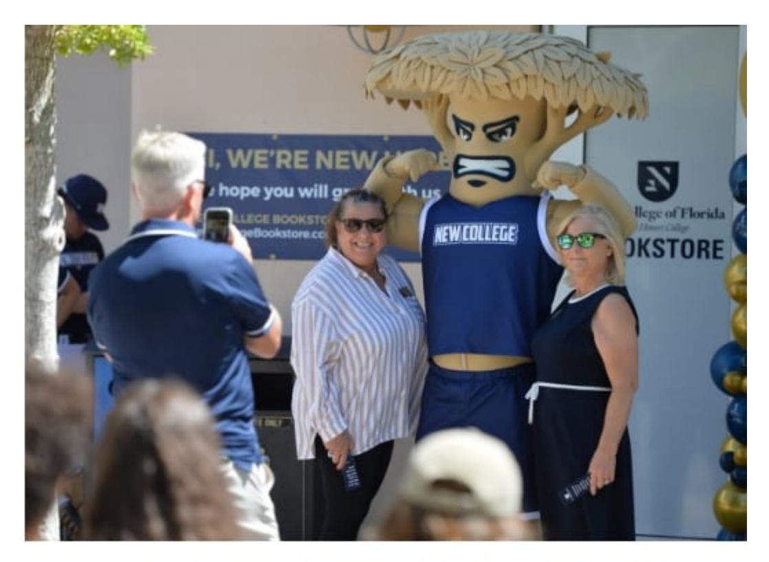
Guests as the New College of Florida Bookstore ribbon-cutting ceremony pose for a photos Thursday, Sept. 19, 2024, with "Rooty" the Mighty Banyans mascot.