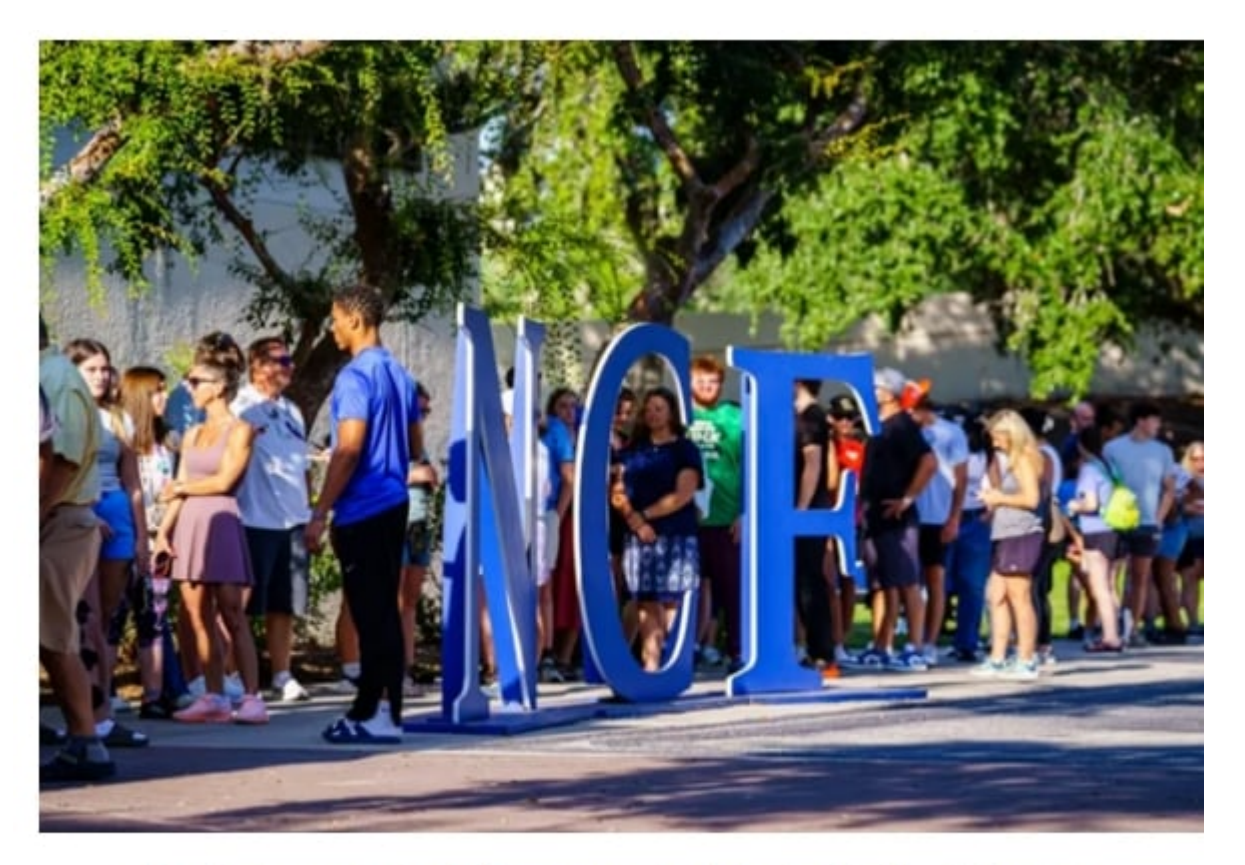
New College students line up on check-in day for the fall 2024 semester Aug. 21