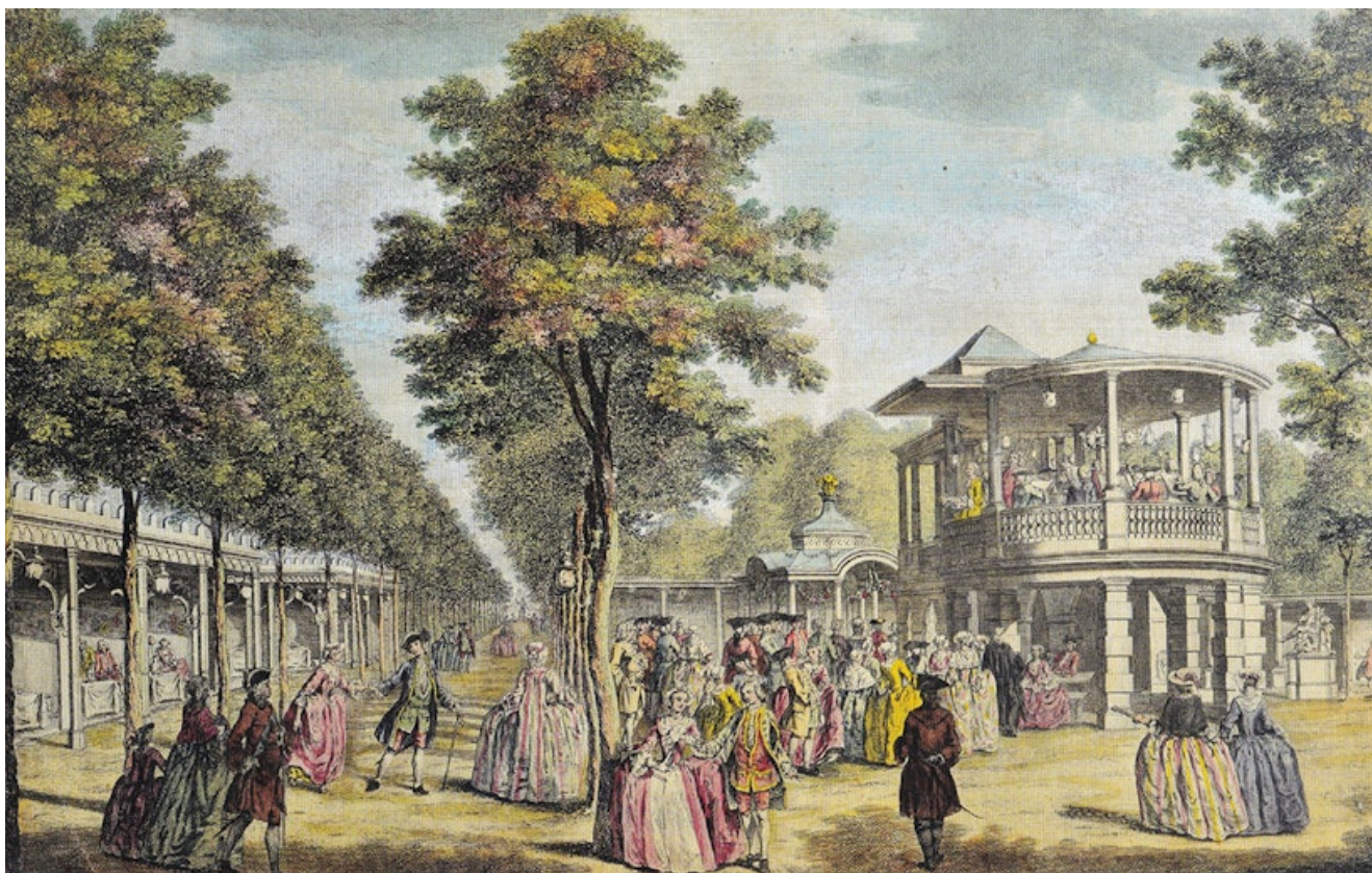
Grand Walk, Orchestra, and Turkish Tent at Vauxhall Gardens,

ough gh I st il l ha ve a fe w co pi es fo r sa le ).