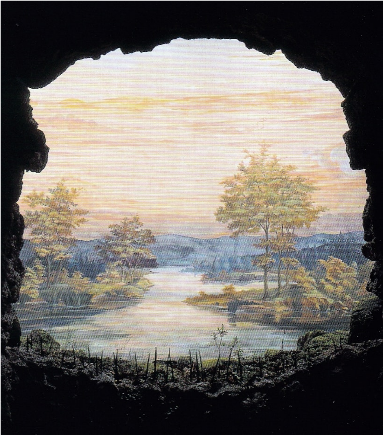
Diorama showing 'The End of the World' at Schwetzingen, Germany (from James Stevens Curl [2022]: Freemasonry & the Enlightenment [Holywood: Nerfl Press], 234).