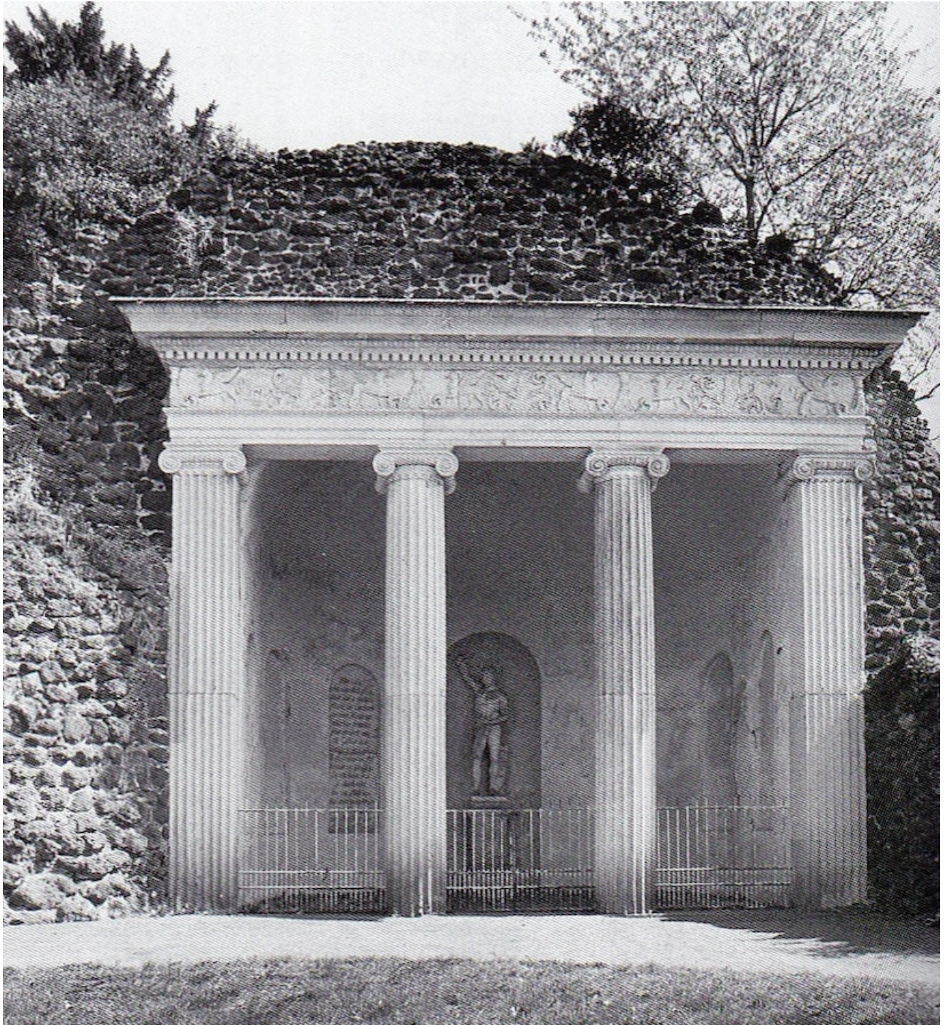
The Ionic Nymphæum at Wörlitz (1767-8), designed by Freiherr von Erdmannsdorff, a favourite place of resort by Friedrich von Matthisson, whose lovely Adelaide was set to music by Beethoven.