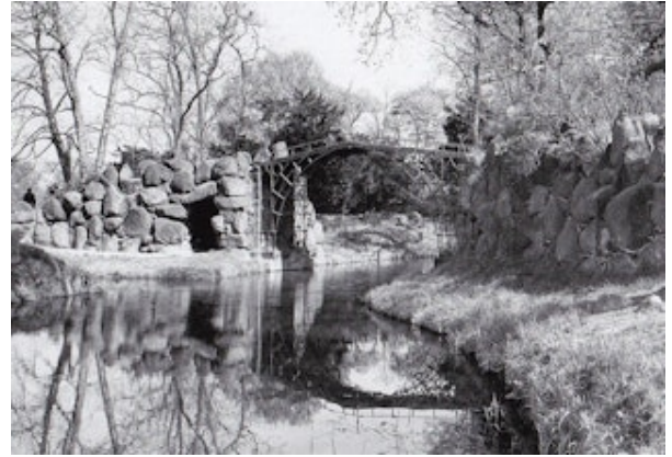
The Eiserne Brücke at Wörlitz, with rock-work abutments (1791): a scaled-down version of the celebrated Iron Bridge over the River Severn in Shropshire, designed by Pritchard and erected 1777-9.