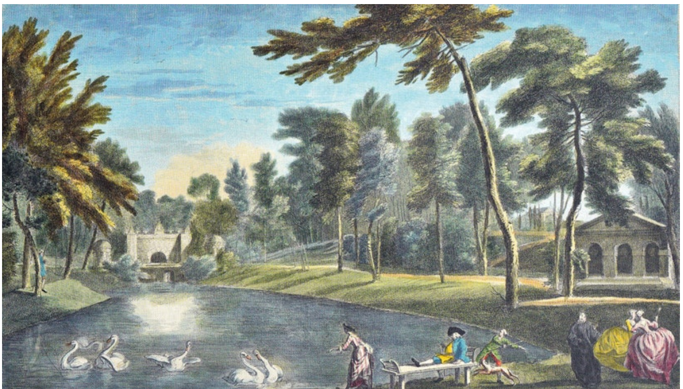
View of the Grotto at Stowe, Buckinghamshire (1753), by George Bickham Jr (c.1706-71) after Jean-Baptiste-Claude Chatelain (c.1710-70).

of the evolution of the landscape garden, but they could also act as drivers of that historical story. It is interesting that prints of the same garden at different periods are useful records of changes in style and taste: Symes tells us that the aims of his book are to show the range of depiction of gardens in the mid- to late 18th century, to “read” gardens from prints, and to attempt to determine what they reveal or tell us about attitudes to the landscape garden. “The element of illusion looms large in the landscape garden, things appearing to be what they are not” (“ruins”, for example, recently erected as an eye-catcher, might not be just there for aesthetic reasons, but to give an aura of antiquity to the “landskip”, and thereby a suggestion that the current owner’s family had been in possession of the estate for centuries [which was often not the case]): how better, Symes asks, “to convey the deception than by presenting it in pictorial form, giving apparent substance to the illusion?”