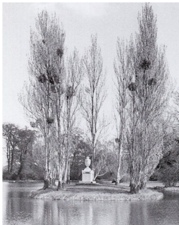
The Rousseau-Insel at Wörlitz (1782), alluding to the original at Ermenonville in France.

Go et he 's E le ct iv e Af fi ni ti es c on ta in s a pa ss ag e re la ti ng to