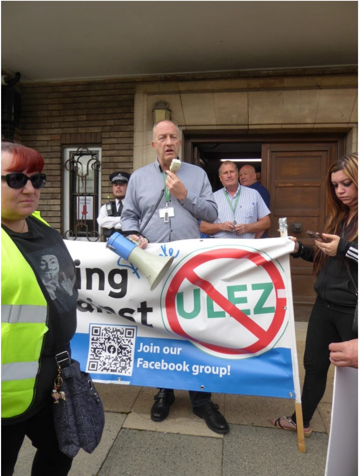
Havering did not join with the 5 councils (Bexley, Bromley, Harrow, Hillingdon and Surrey) who took Transport for London