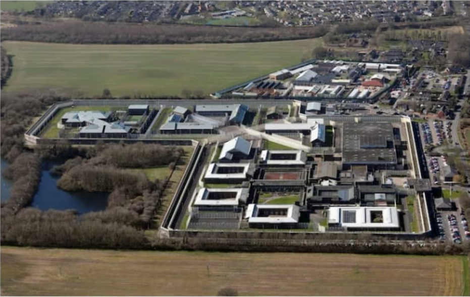
It is suspected that Hashem Abedi may have received a weapon from a drone drop at HMP Frankland

It is understood that Abedi was being held in one of the separation units in Frankland, which are designed for prisoners who pose a risk to staff and other inmates.