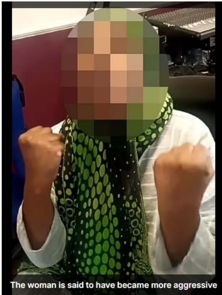
The woman is said to have become more aggressive

A Muslim woman screamed 'Allahu Akbar' inside a church and said she was 'here to kill the God of the Jews' shortly before a Sunday morning service.