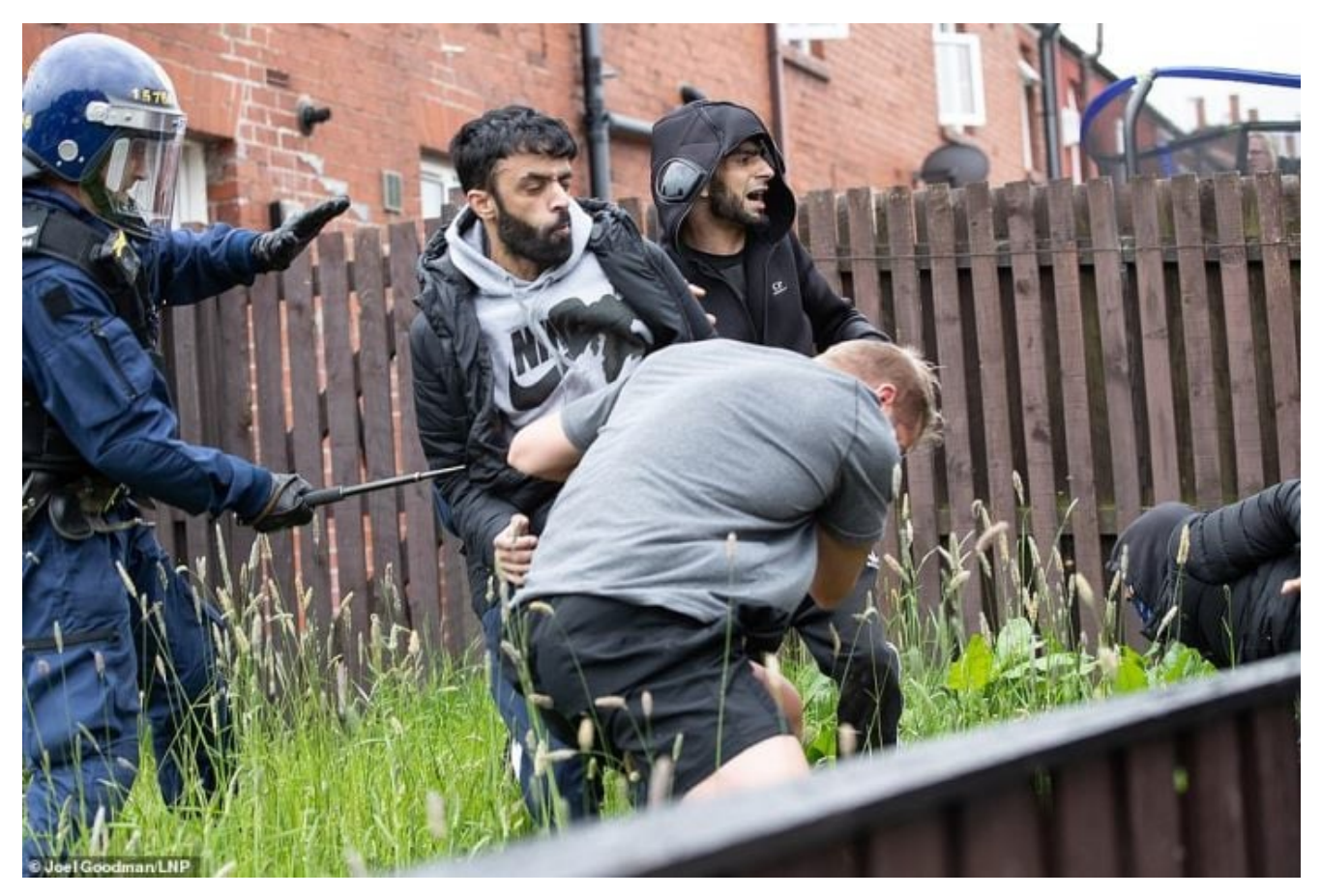
Why is the local Manchester newspaper so scared of these boys that they only print a picture of Tommy, two pictures of police officers and bland sentences saying bricks were thrown, and cars damaged, but not by who, aimed at who? Who controls them? Inquiring minds would like to know.

it really ought to say (mealy mouthed tactful version) "Thugs beat boy they disagree with while police try to stop them". If I said what I really think I'll get suspended from social media again.