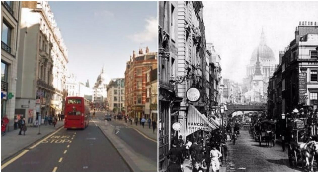
Fleet Street today and in 1890