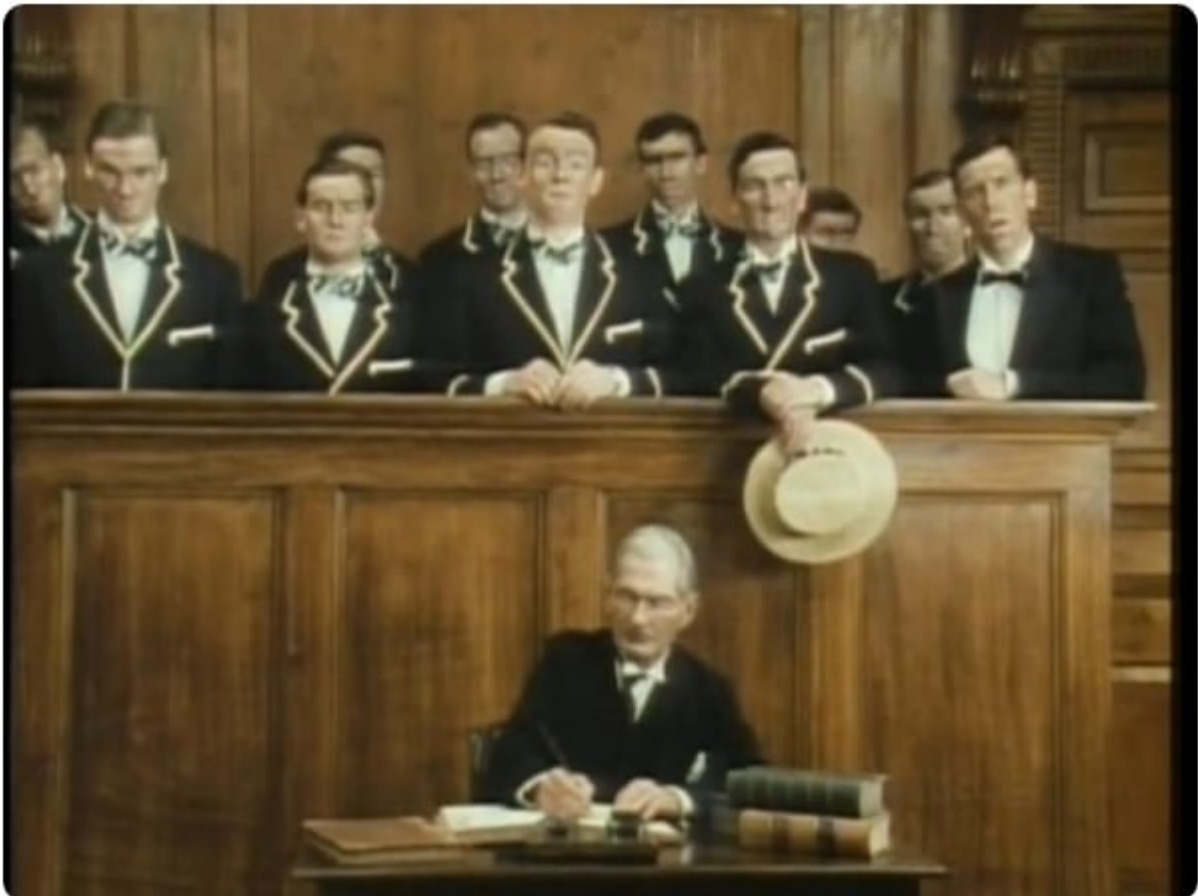
Still from the TV series Jeeves and Wooster