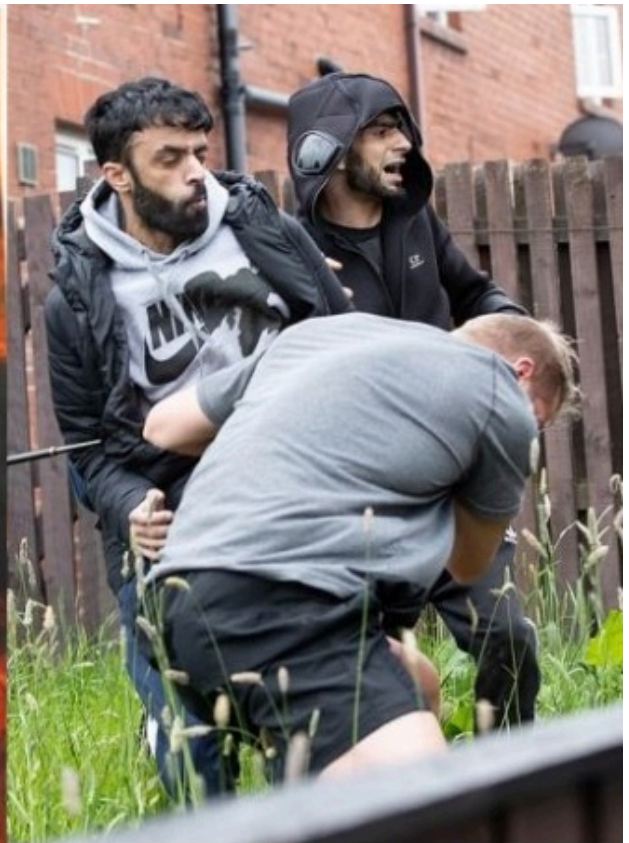
OLDHAM BRICKS, BLOWS AND INTIMIDATION WE WILL NOT BE SILENCED

I hope that Tommy's campaign team get at the very least a refund of the money they paid to have the campaign leaflets delivered across the region. Hope not Hate are funded from the bottomless pockets of George Soros.