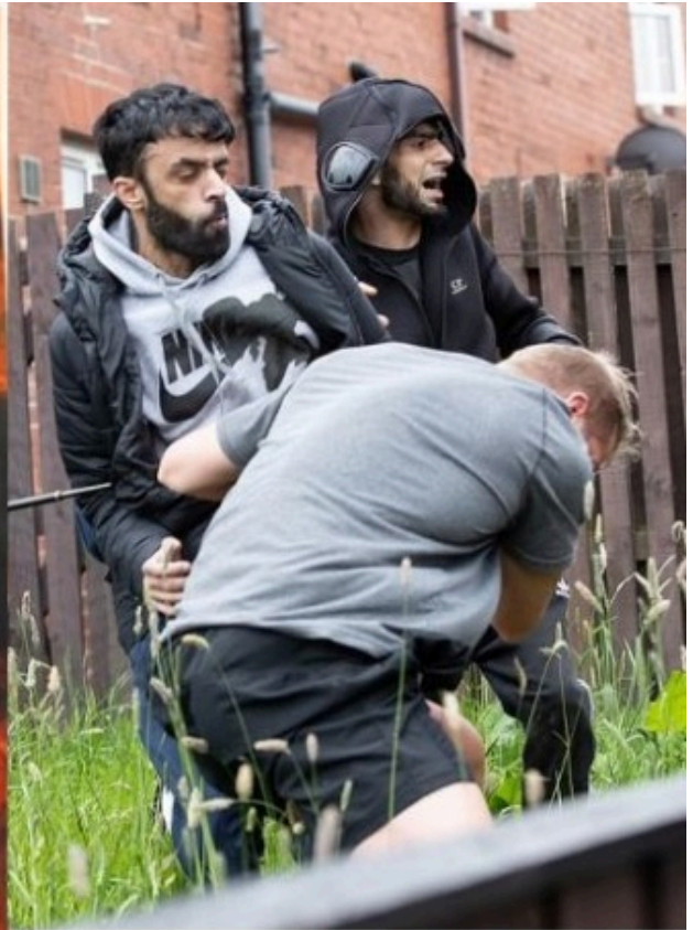
OLDHAM BRICKS, BLOWS AND INTIMIDATION WE WILL NOT BE SILENCED

I hope that Tommy's campaign team get at the very least a refund of the money they paid to have the campaign leaflets delivered across the region. Hope not Hate are funded from the bottomless pockets of George Soros.