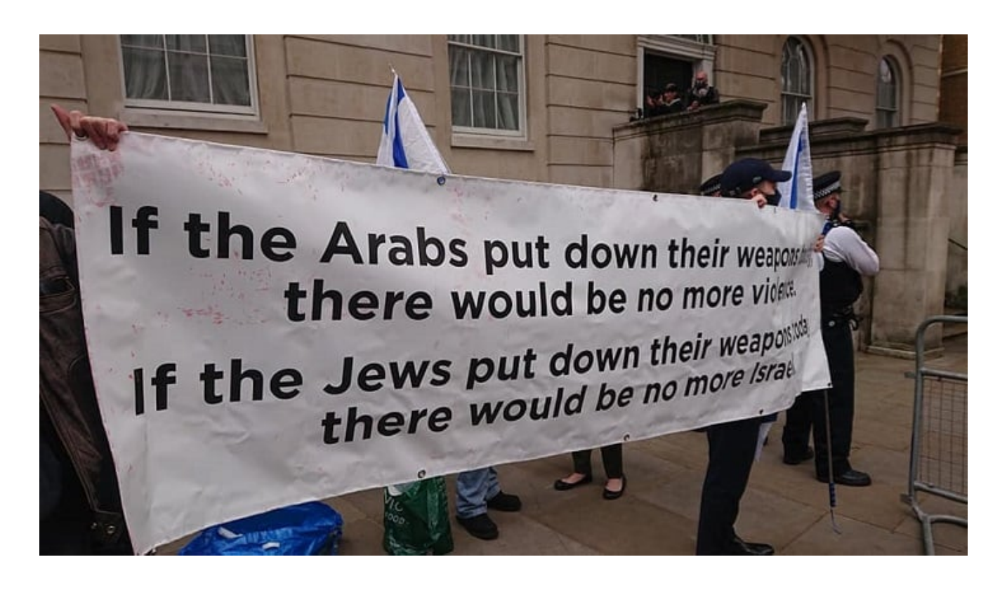
A banner of peace was rolled out.