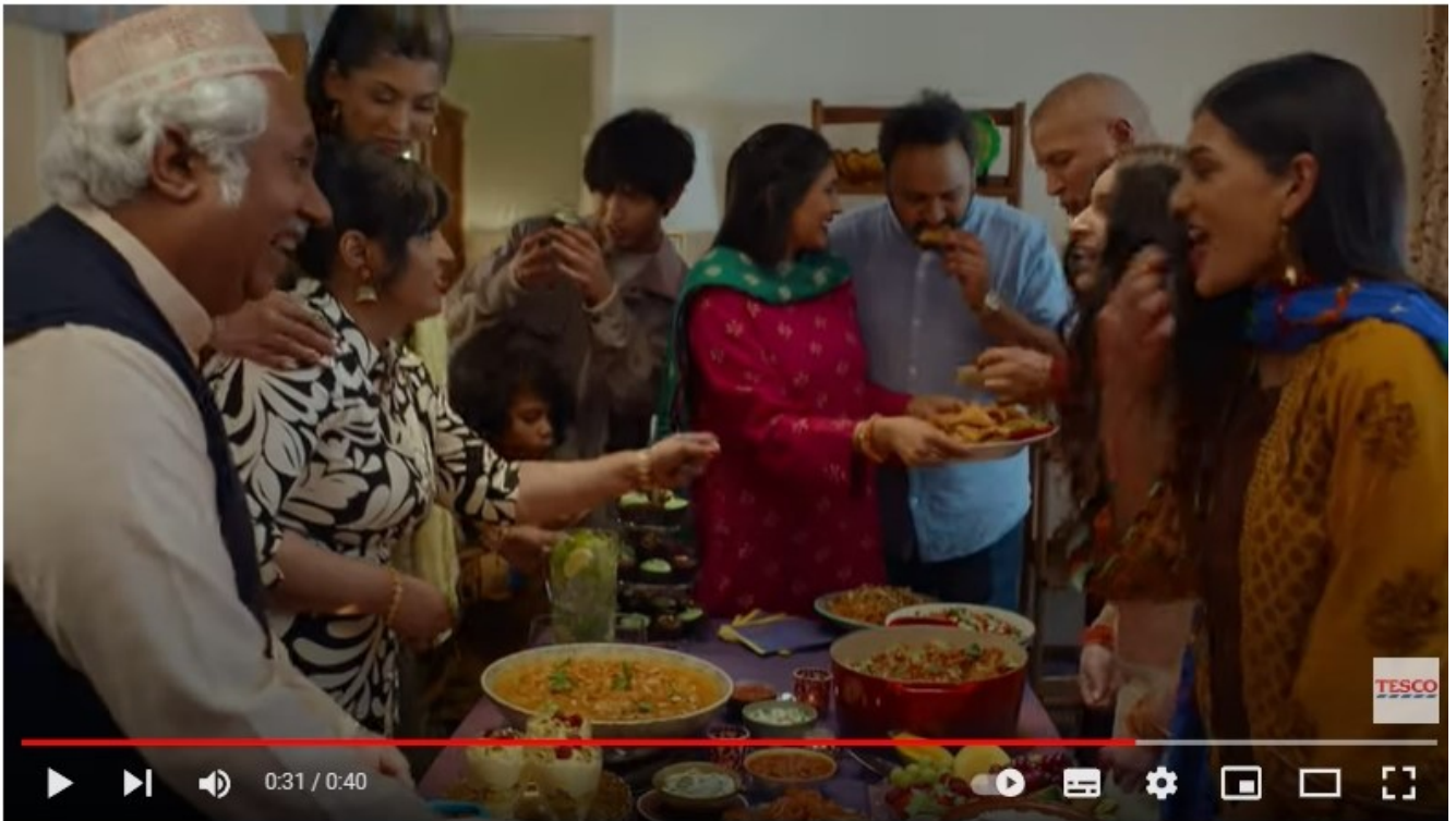
Tesco Food Love Stories | Alia's 'Worth The Wait' Samosas | Tesco