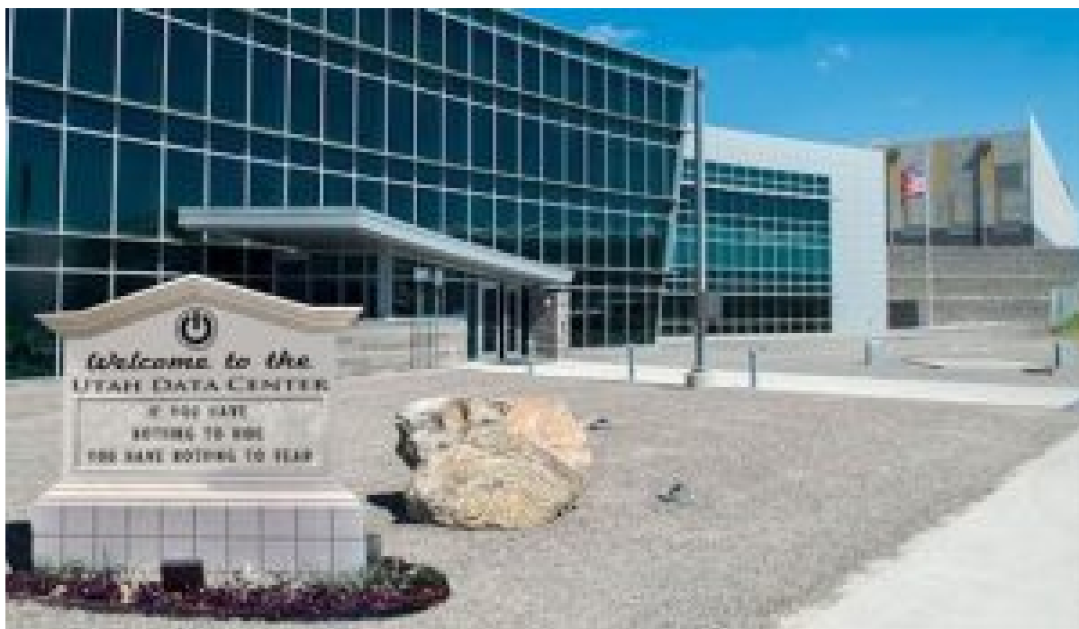
NSA motto at Bluffdale

Never mind. If you have nothing to hide, you have nothing to fear.