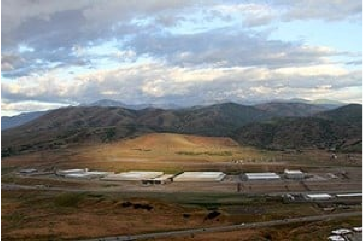
Bluffdale Data Center, Utah

The “stake” in stakeholder capitalism goes through the heart of individual liberties.