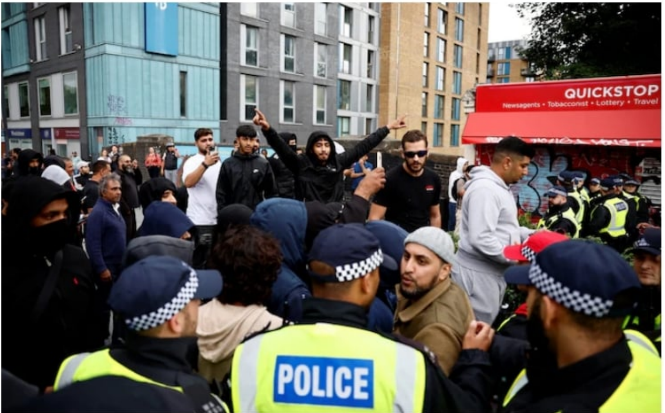
Police officers disperse a group of residents chanting 'Allahu Akbar'

Walthamstow is subject to a very wide dispersal order today until 4am tomorrow morning; it covers my old schools, my old home and my parent's grave.