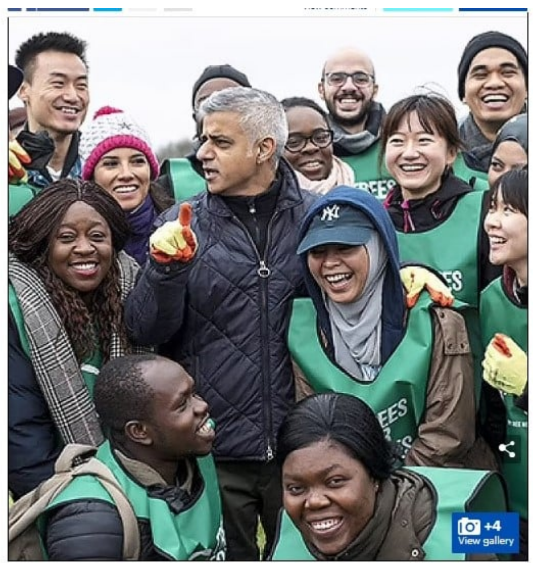
'Recognisable, real and diverse London': This photograph was given the green light in the guide