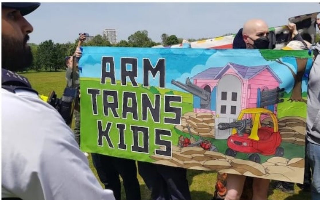
Trans rights demonstrators prominently displayed a sign proclaiming 'arm trans kids'

Transgender activists confronted gender-critical Let Women Speak advocates leading to the standoff, with officers positioning themselves between the two factions.