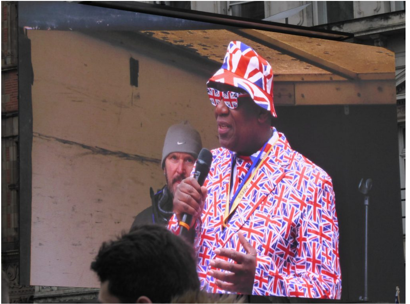
Next is Liam Tuffts, very well known with a popular podcast.