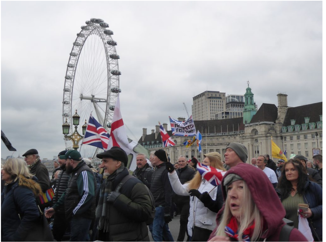
London Eye and the London Aquarium behind.