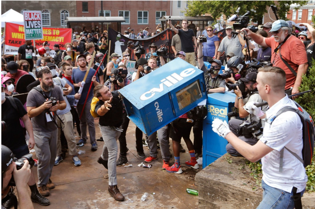
Yuppie/preppie riot in Virginia

neighborhoods whilst white thugs travel far and wide. White men in black, white millennial punks for hire , are fixtures now at rallies, town halls, and street demonstrations nationwide. Recent riots at UC Berkeley and University of Virginia in Charlottesville are probative.