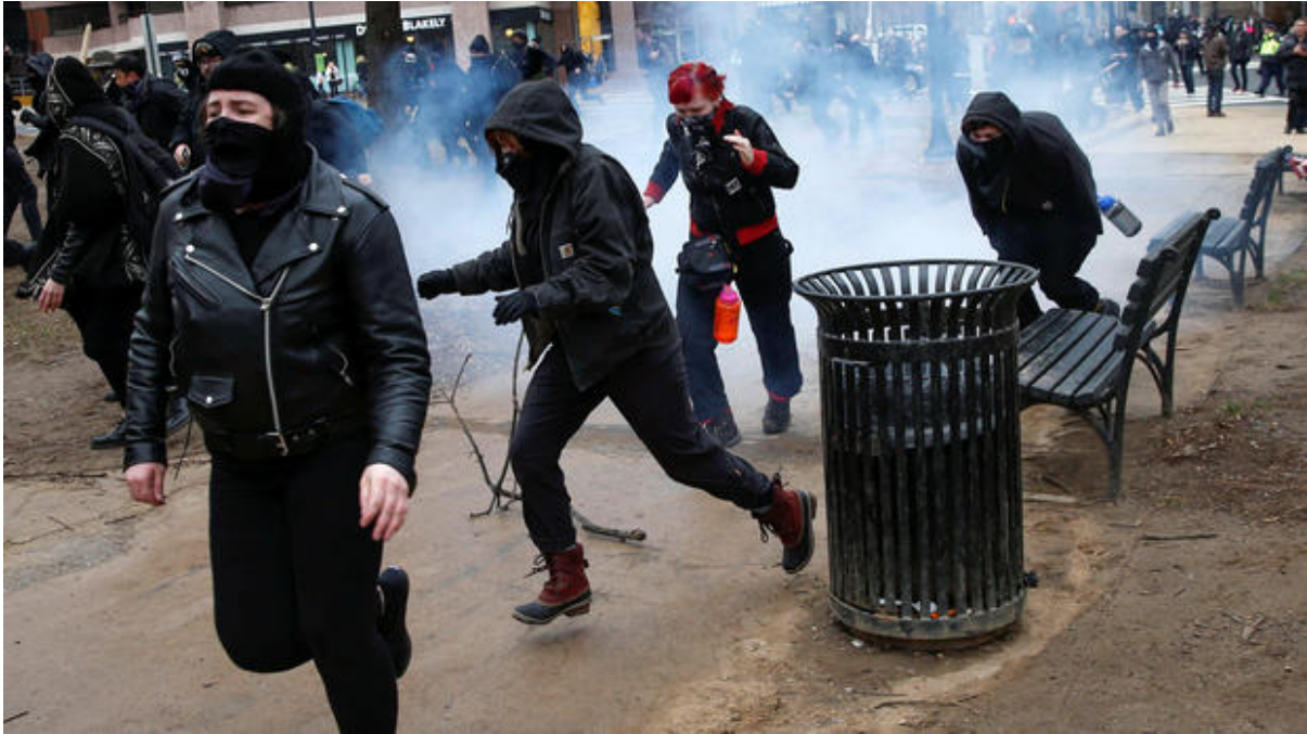
Washington, DC, 2017 Inauguration Day riots

A few years after the Martin Luther King riots of 1968, I was driving through Harlem in upper Manhattan. At several traffic lights I was greeted by a corner chorus of “right on man, Chocolate City.” Perplexed at first, I soon realized that the raised fists and the shouts were for my District of Columbia license plates. The salutes were for DC, the nation’s capital, in those days a rare majority black town.